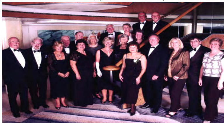
The group at one of the formal functions.